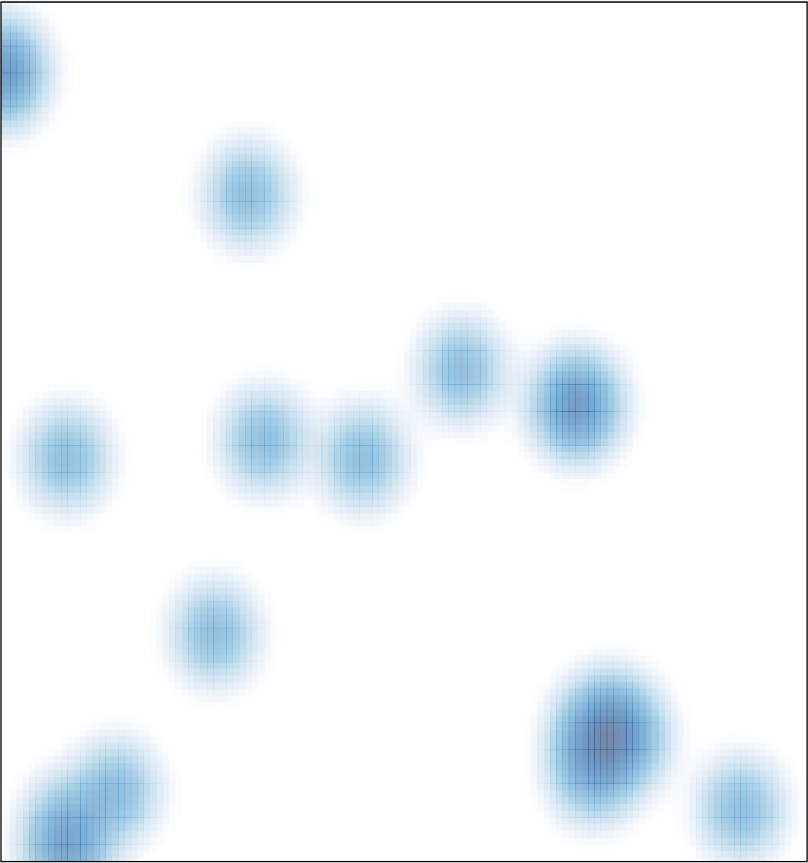
# features = 18 , max = 2